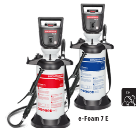
e-Foam 7 P

The entire tank contents can be completely foamed without interruption, enabling large-area and time-saving cleaning. Different sprayers are available for different areas of application – optimised for handling both acids and alkalis. The sprayer has a large, stable base with an integrated foam holder, ensuring that it stands securely.