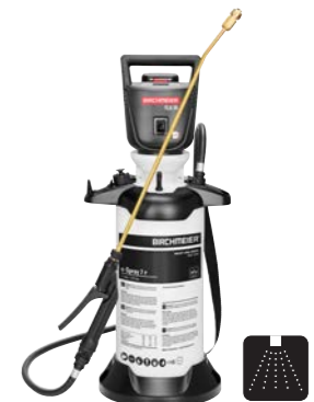
e-Spray 7 P

The powerful battery compressor ensures a consistently high delivery rate, while the large, stable base with integrated spray pipe holder ensures secure footing and practical handling – even under demanding conditions.