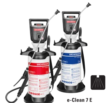
e-Clean 7 P

Convenient and efficient cleaning thanks to the sprayer specially developed for use with acids or alkalis. The sprayer has a large, stable standard base with an integrated spray pipe holder for secure footing.