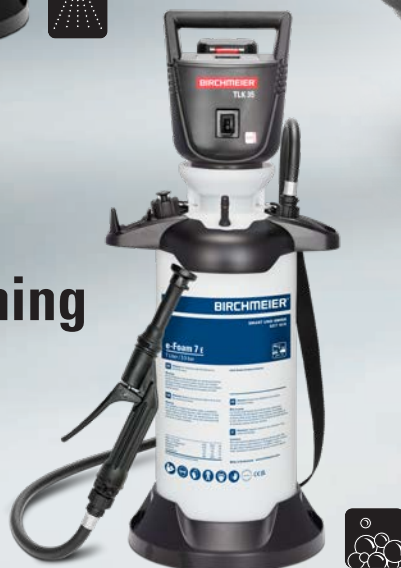
e-Foam 7 E