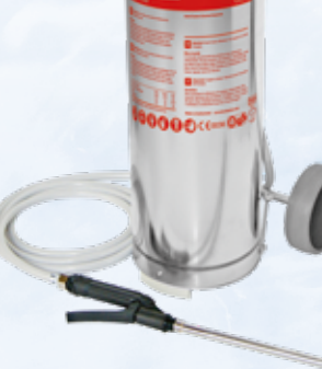
Vario-Matic 1.25 PE